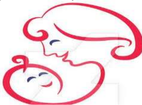
Image: Healthy Family - Healthy Indonesia